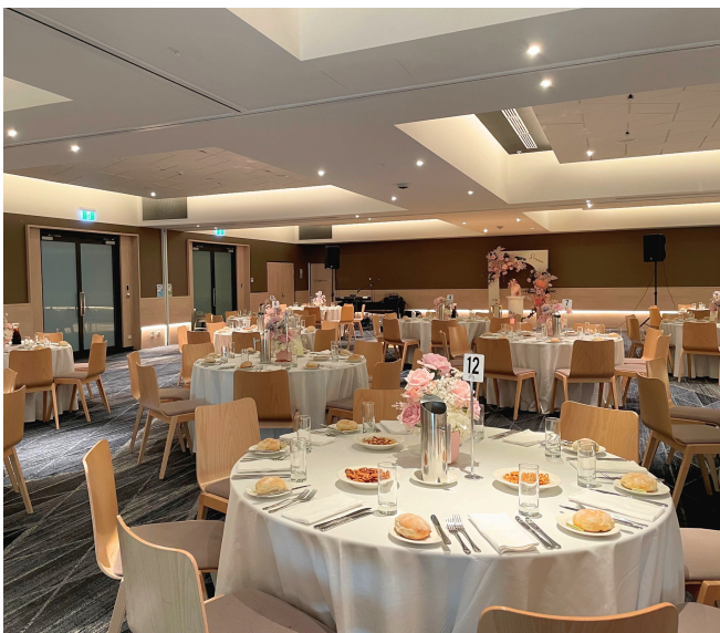
Pictured: Conservatory 1,2,3&4