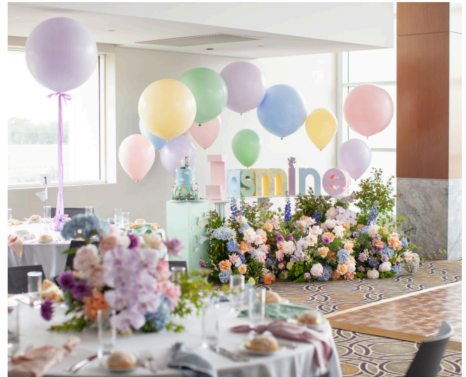
Pictured: Terrace Rooms 3&4